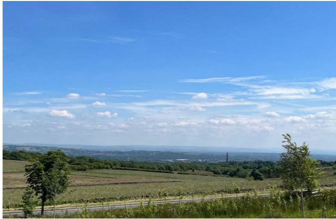
The Smithills Estate looking towards Bolton

"We have got to work straight away on site, and we hope this will be the start of working on further sites with the Woodland Trust in years to come."