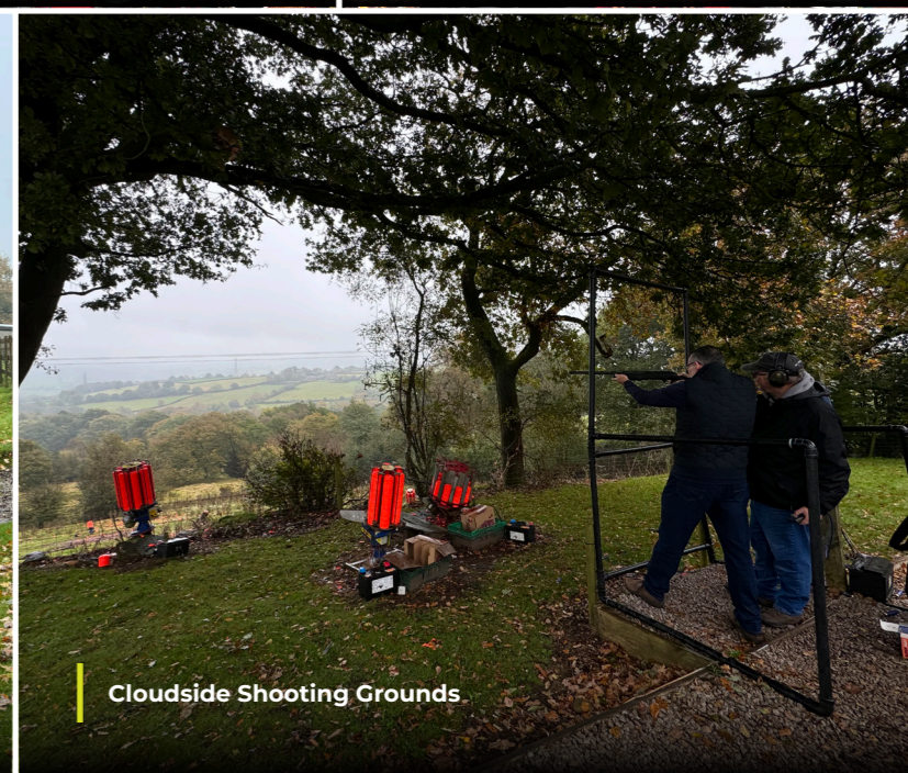
Cloudside Shooting Grounds