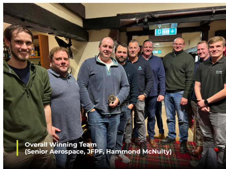
Overall Winning Team (Senior Aerospace, JFPF, Hammond McNulty)