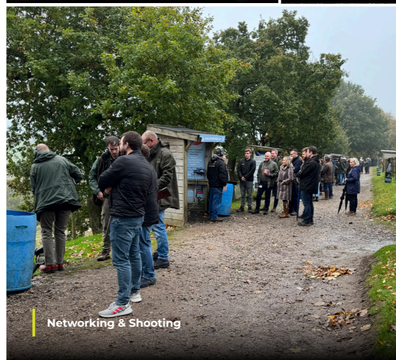
Networking & Shooting