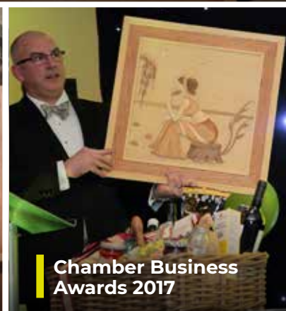
Chamber Business Awards 2017