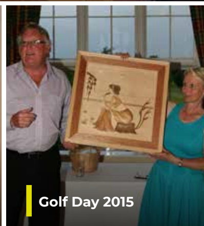
Golf Day 2015