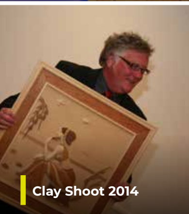
Clay Shoot 2014