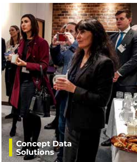
Concept Data Solutions