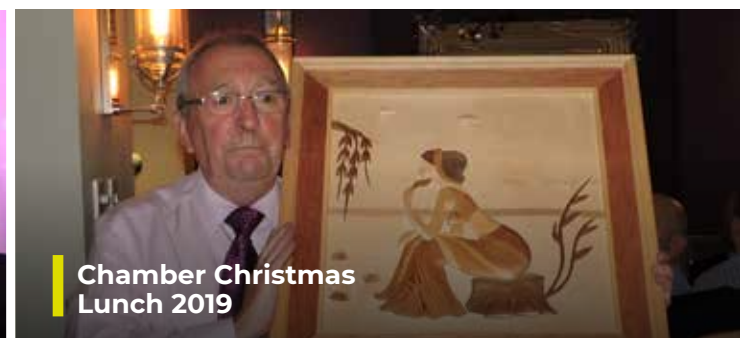
Chamber Christmas Lunch 2019