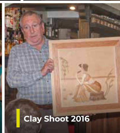
Clay Shoot 2016