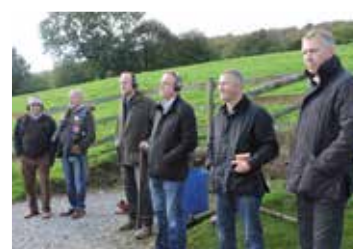
Spring Clay Shoot 29th April 2020