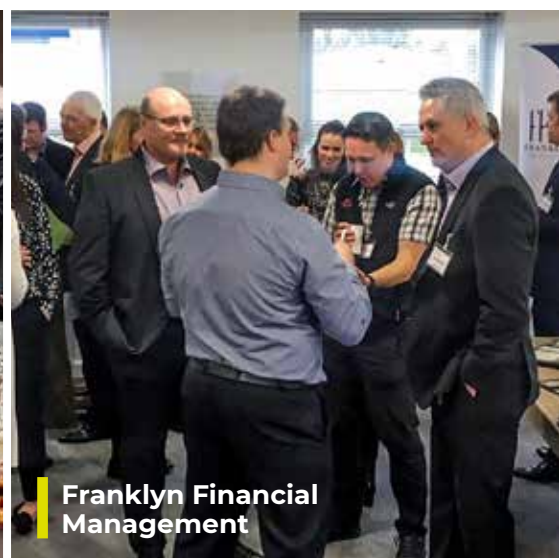
Franklyn Financial Management