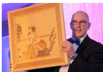
The "Magic Picture" Over £10,000 has been raised

BUSINESS OF THE YEAR AWARD | START UP BUSINESS OF THE YEAR AWARD EXCELLENCE IN CUSTOMER SERVICE AWARD | PROFESSIONAL SERVICES AWARD INTERNATIONAL TRADE AWARD | APPRENTICE OF THE YEAR AWARD | EMPLOYER OF THE YEAR AWARD TOURISM AWARD | INNOVATION AND TECHNOLOGY AWARD | MANUFACTURER OF THE YEAR AWARD CHARITY OF THE YEAR AWARD | CORPORATE & SOCIAL RESPONSIBILITY AWARD