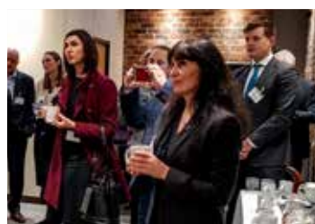
Thursday Thirty Latest Chamber events