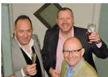
Christmas Lunch Another successful festive event