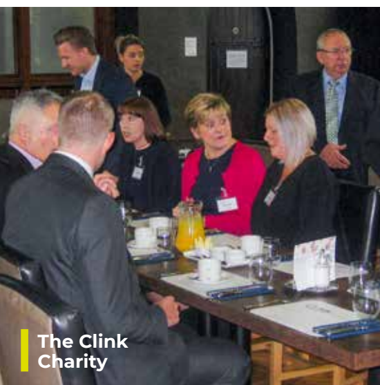
The Clink Charity

The room was really buzzing with activity and it was good to see the new members taking the opportunity to network. As always with the East Cheshire Chamber there was a very warm welcome for all of the attendees.