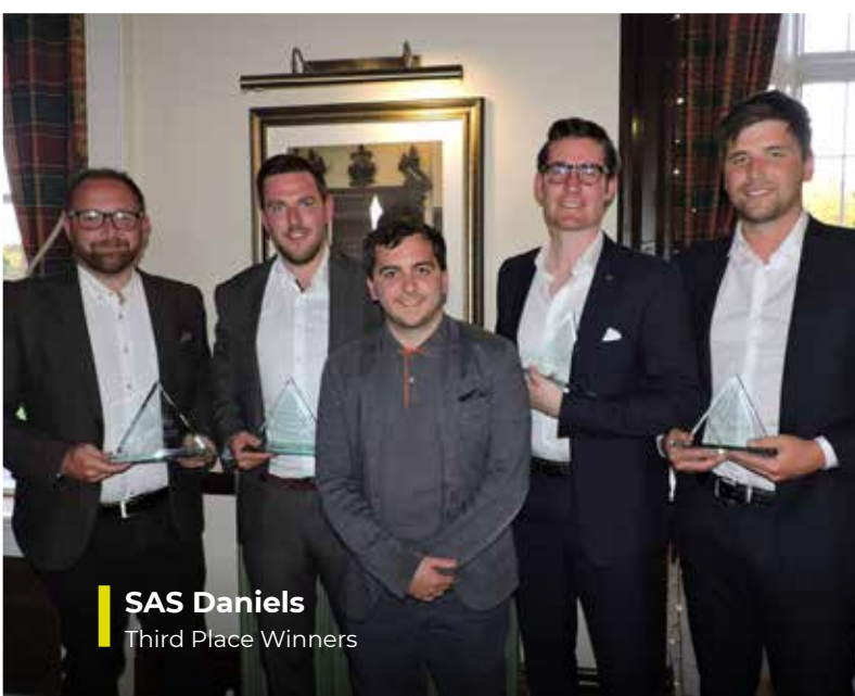
SAS Daniels Third Place Winners