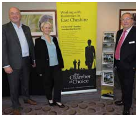
Chamber Expo Friday 18 th October at De Vere Cranage Estate