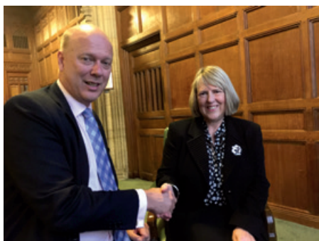
Fiona Bruce MP with Transport Minister Chris Grayling in Parliament as the announcement is made.

Middlewich MP Fiona Bruce, who has campaigned for years for funding for a bypass in Middlewich, was delighted to welcome the announcement by the Secretary of State for Transport on 19th October of £46.8m funding towards a total cost of £56.9m for the Middlewich Eastern Bypass. This will reduce congestion in the town centre and facilitate the opening up of employment land with the potential to provide over 2,000 jobs. The funding is one of only two new large local major road schemes receiving approval