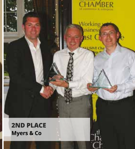
2ND PLACE Myers & Co