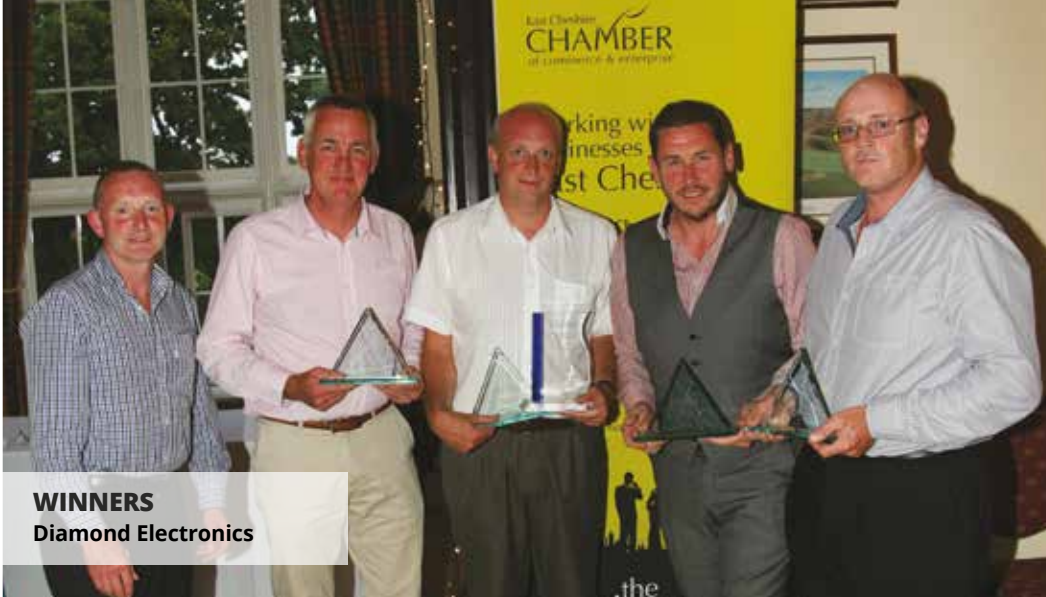
WINNERS Diamond Electronics