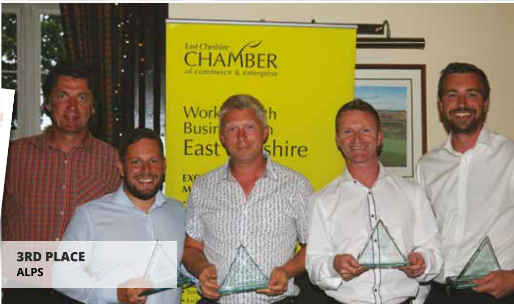
3RD PLACE ALPS